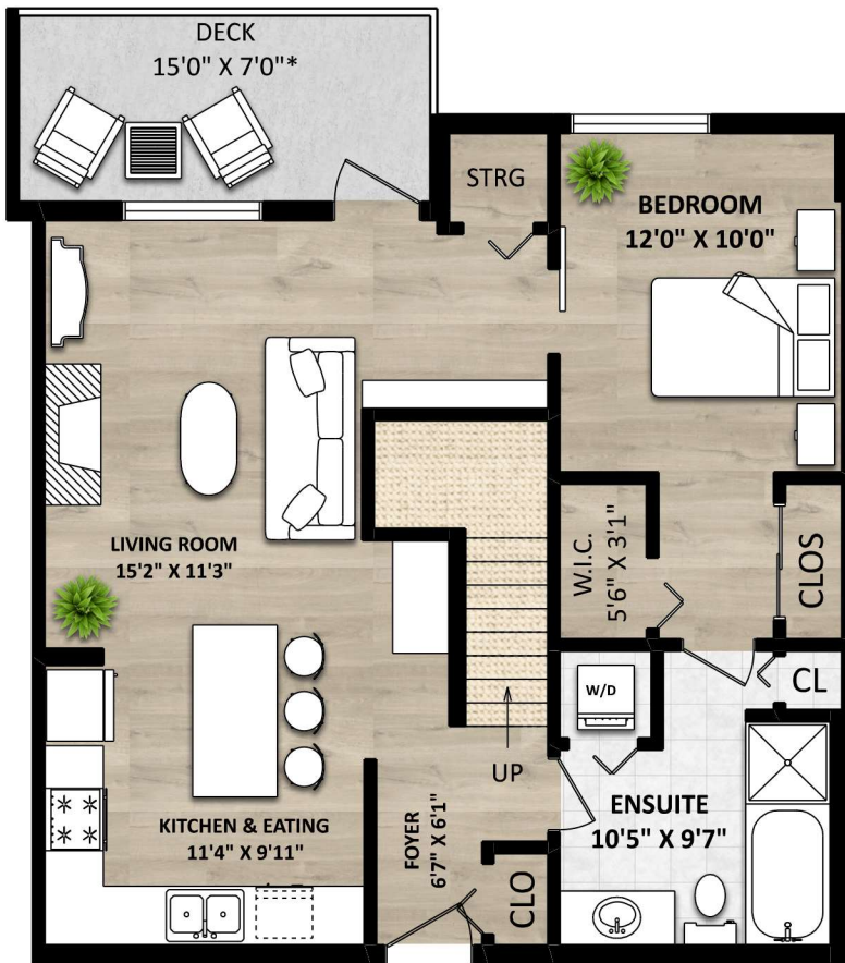
MAIN FLOOR: 811 SQ.FT.